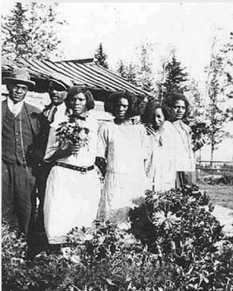
A family in Amber Valley, AB

Significant to note were events that occurred in Oklahoma as it joined the United States in 1907. Black Americans were denied the right to vote, were segregated and refused entry to certain public places. There were also public lynchings especially one case where a mother and son were hanged from a bridge and photos were taken while the public looked on.