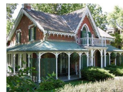
Hillary House 15372 Yonge St, Aurora, ON L4G 1N8

It contains a significant collection of medical instruments, books, papers, household furnishings, and equipment dating from the early nineteenth to the late twentieth century and is open to the public as Hillary House, the Koffler Museum of Medicine. Artifacts on display take us from the time of leeches and bleeding to the advent of penicillin. As the doctors' families lived in Hillary House as well, the generational change is represented in the array of furnishings, clothing and social aspirations.