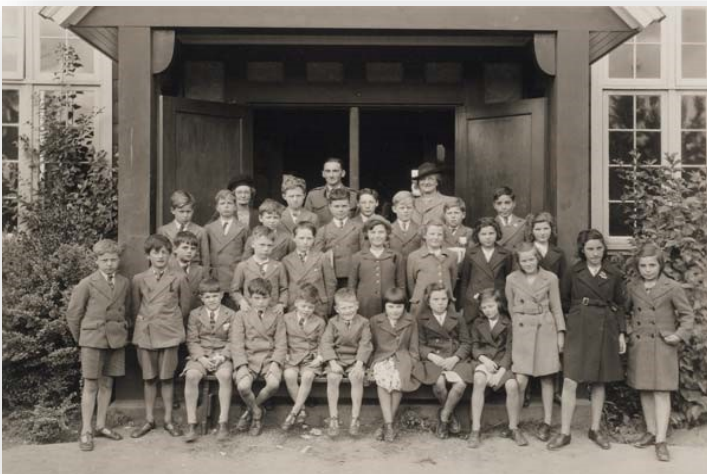
Fairbridge Farm School Students 1945