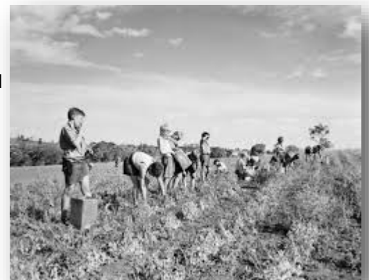
Fairbridge - Australia

Roddy also notes that the Australian Government were ready to step up to the plate and provided settlement and recourse to reunite families. The Canadian Government has not.